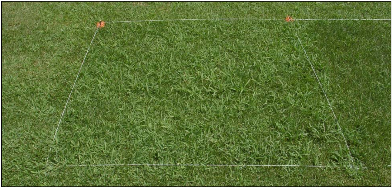
Untreated control plots displaying crabgrass populations. Picture taken 7/21/2005.

y Means within columns followed by the same letter are not different according to Fisher's LSD 0.05 .