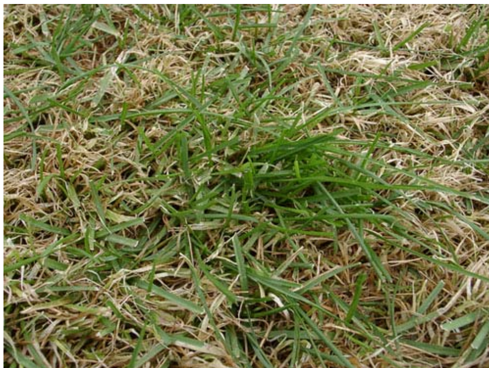
Close-up of creeping bentgrass damage receiving a single application of mesotrione at 0.75 lb ai/A. Kentucky bluegrass (center) was unaffected by the application.

y Means within column followed by the same letter are not different according to Fishers LSD 0.05 .