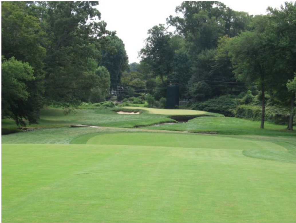
Hole #11-Par 4