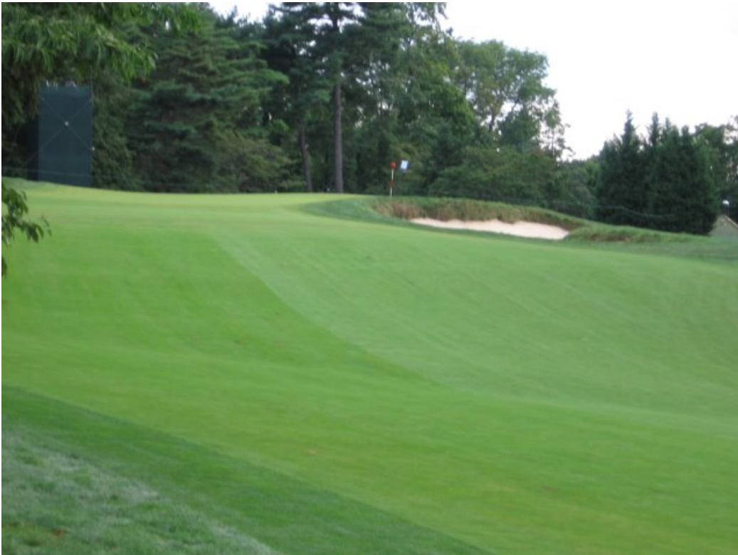
Hole #15-Par 4