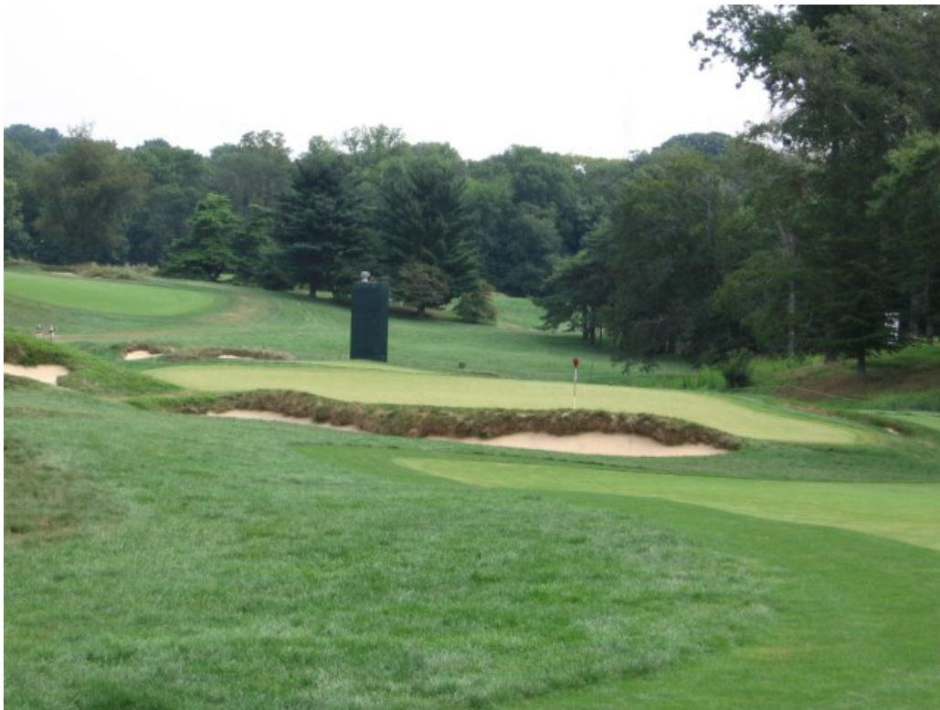
Hole #8-Par 4