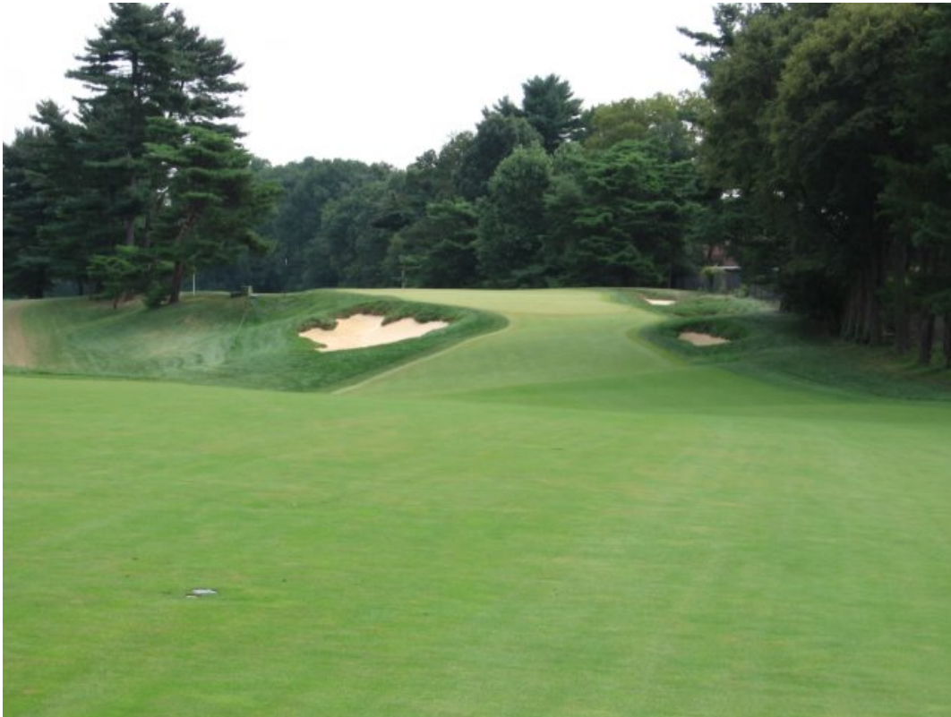
Hole #7-Par 4