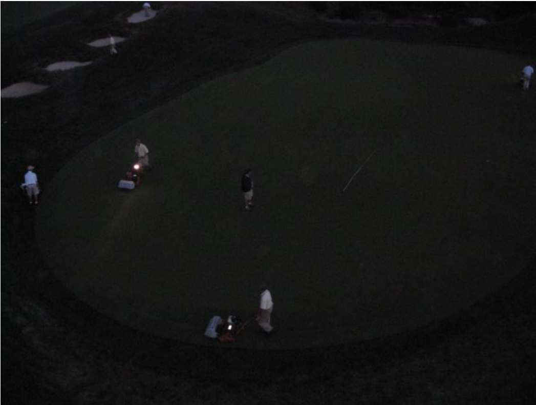
Early morning mowing