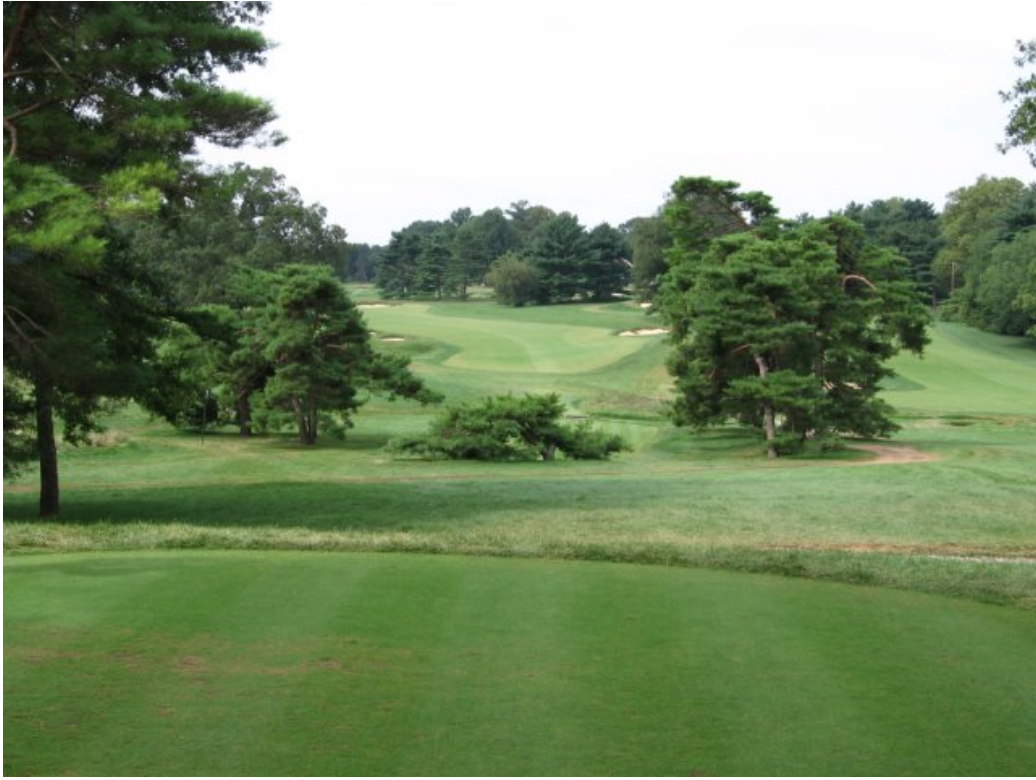
Hole #5-Par 4