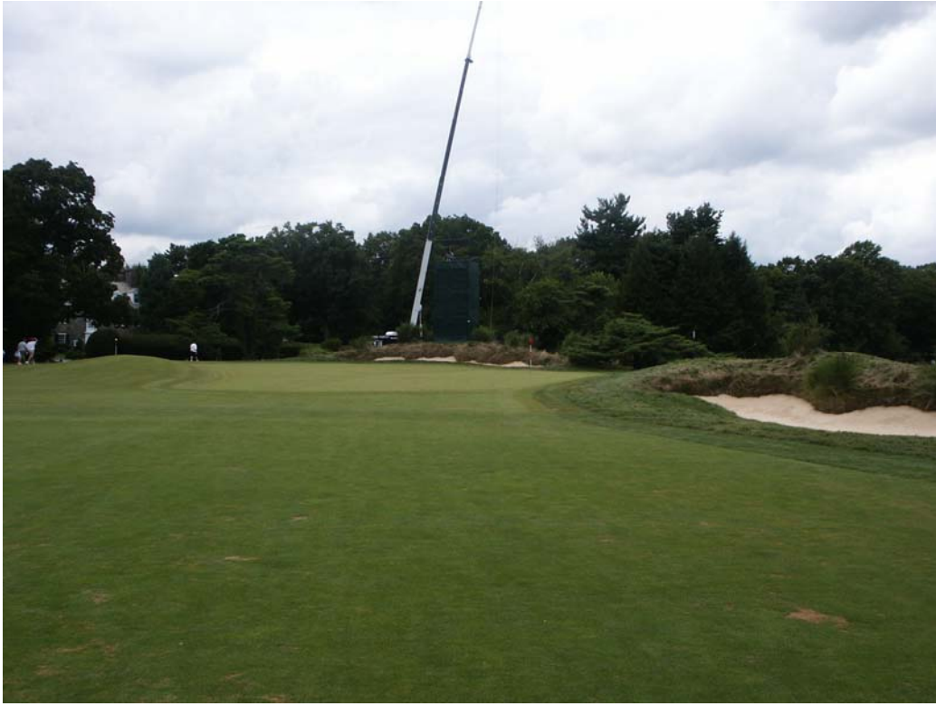
Hole #14-Par 4