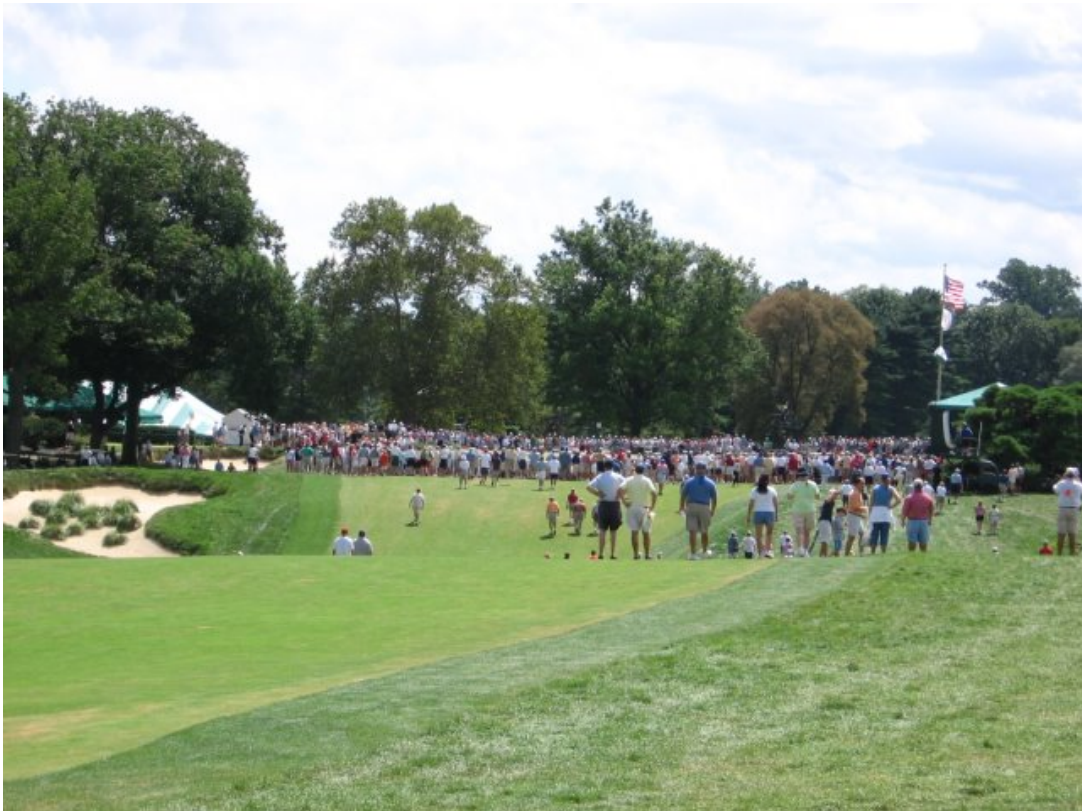
The gallery surrounding the 18 th green during the U.S. Amateur