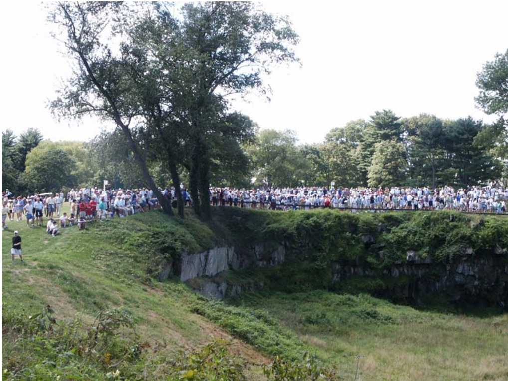
The gallery crowded around the 16 th green and 17 th tee during the U.S. Amateur