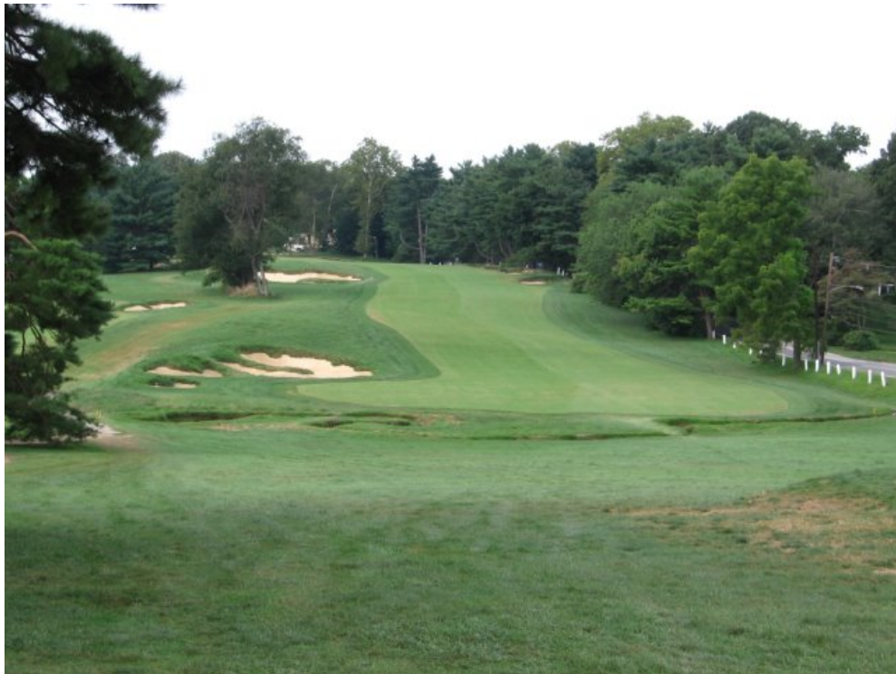
Hole #2-Par 5