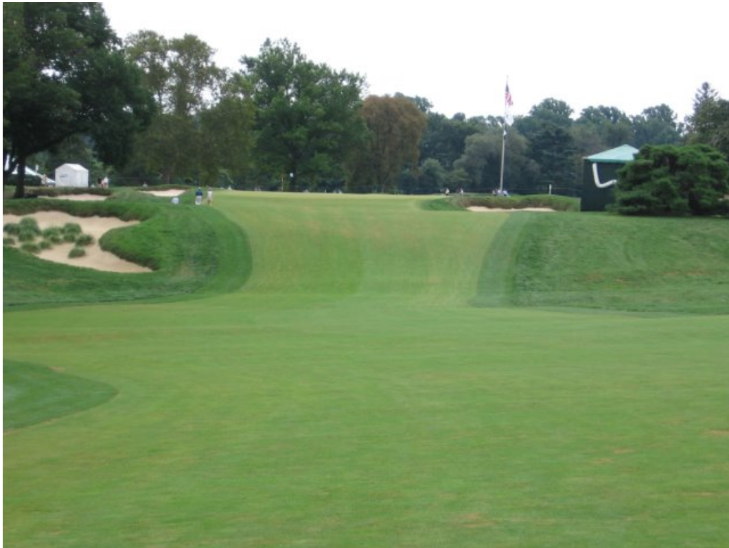
Hole #18-Par 4