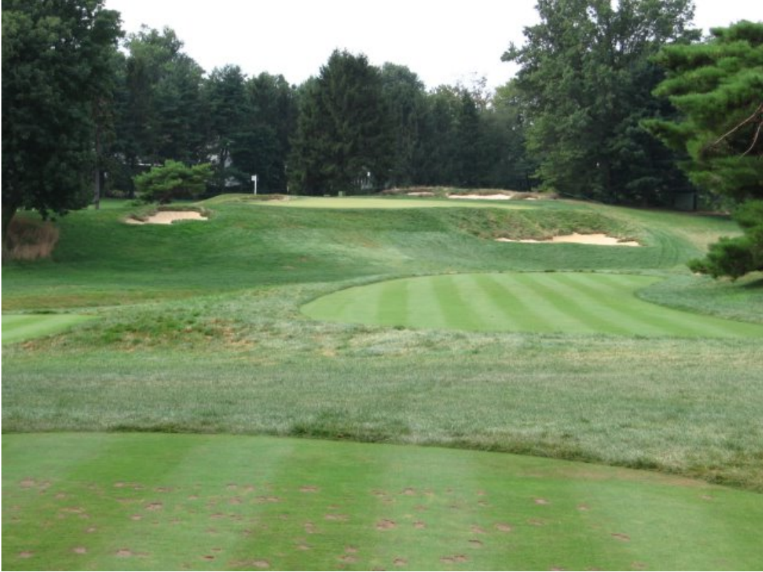
Hole #3-Par 3