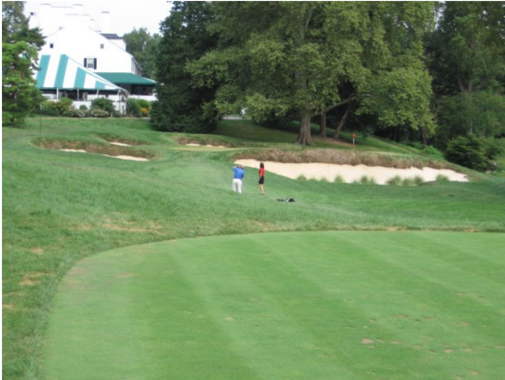
Hole #13-Par 3