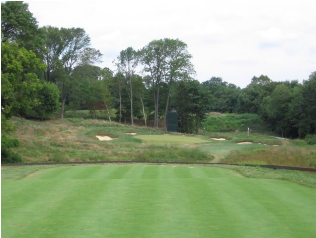
Hole #17-Par 3