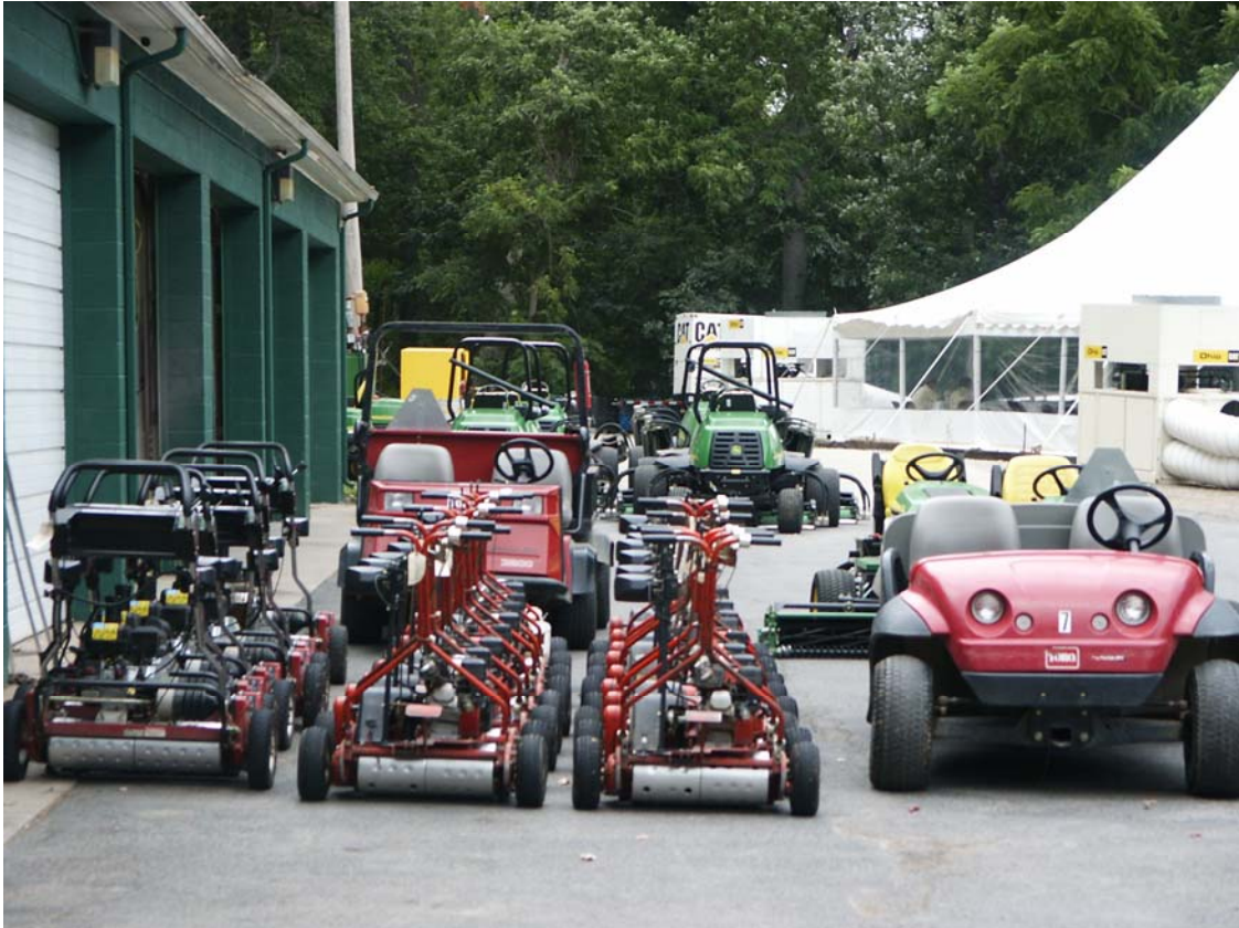
Equipment ready to go back out for the evening after the conclusion of the day's play