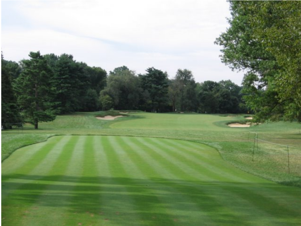
Hole #1-Par 4