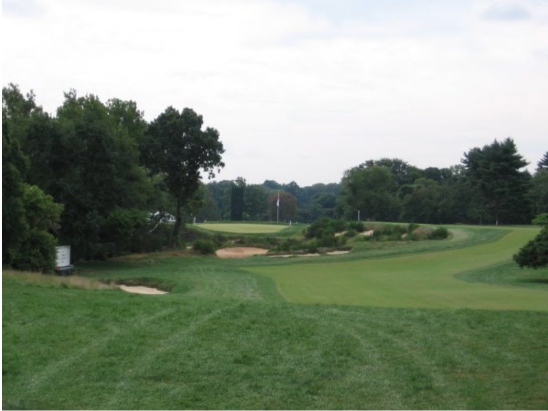
Hole #16-Par 4 (The famous “Quarry Hole”)