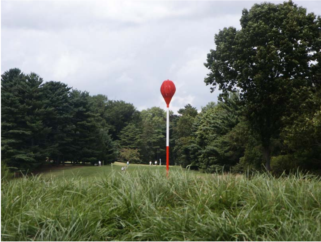
One of Merion's famous wickers