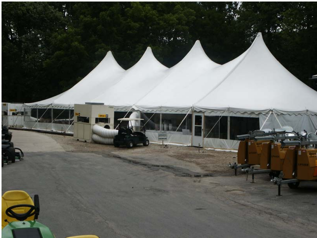
The green staff volunteer tent for the U.S. Amateur