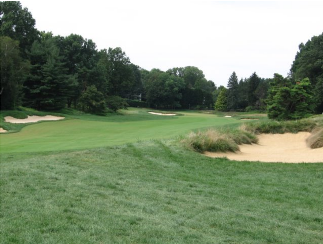
Hole #6-Par 4