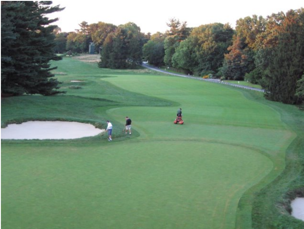
Volunteers fluffing the rough and rolling the approach on #15