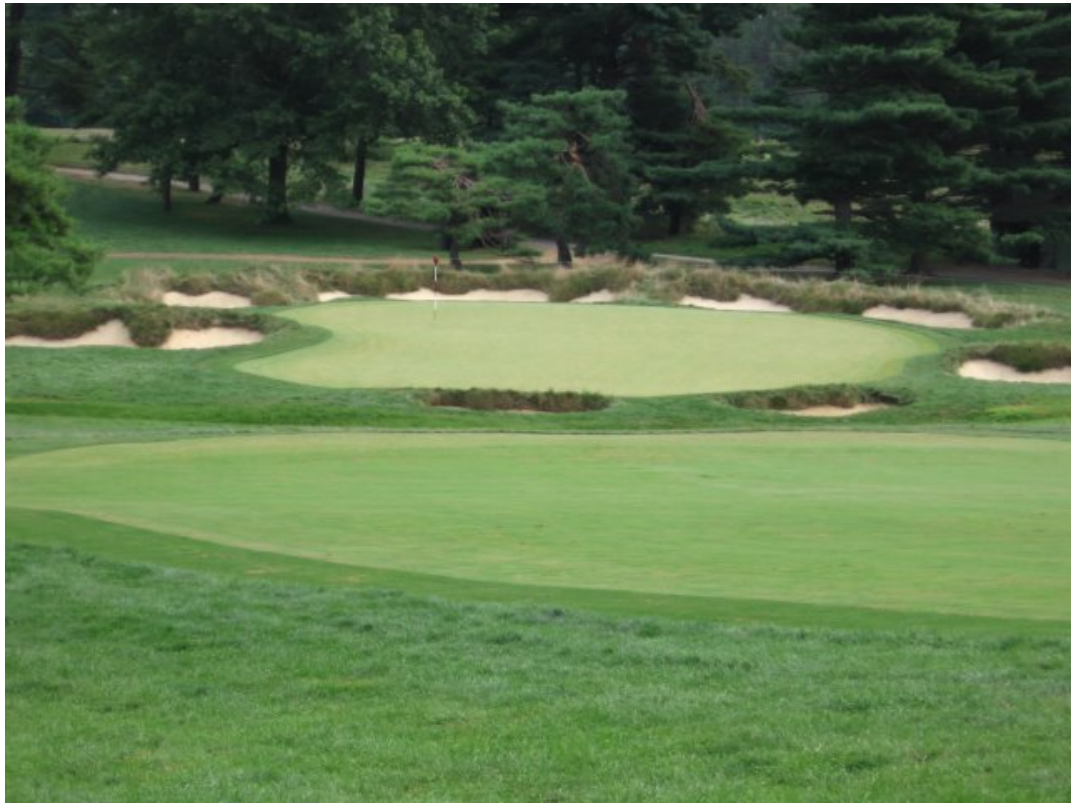
Hole #4-Par 5