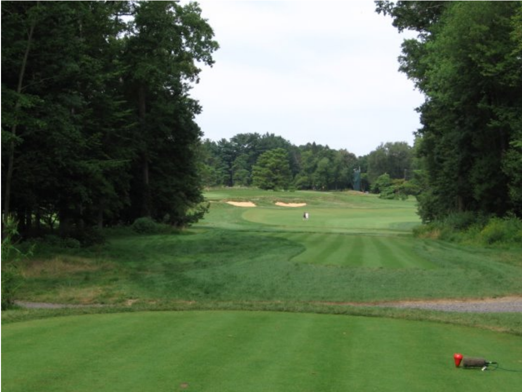
Hole #12-Par 4