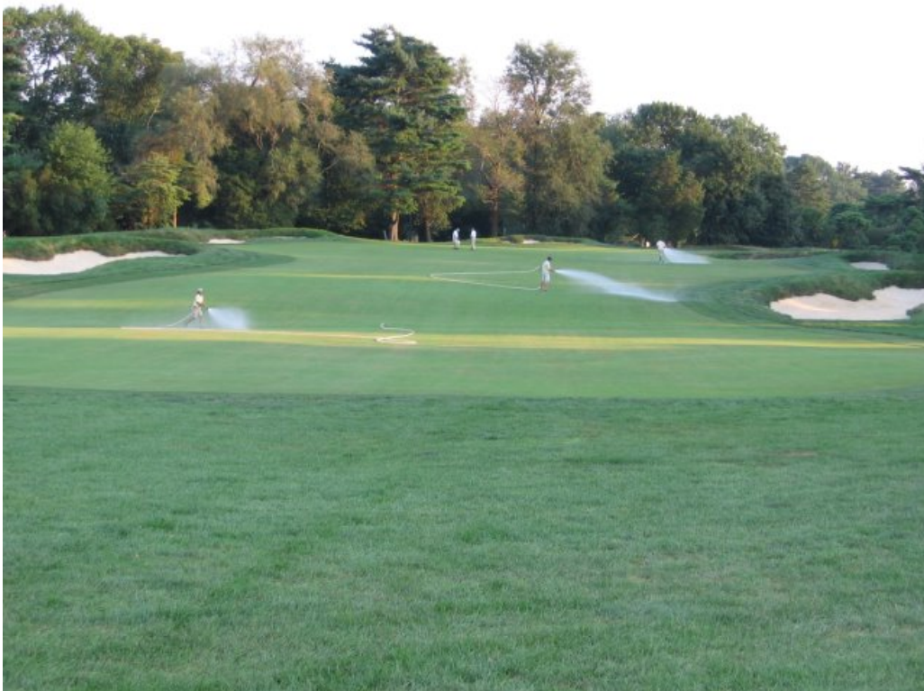
Interns hand-watering the 1 st fairway after a round of the U.S. Amateur