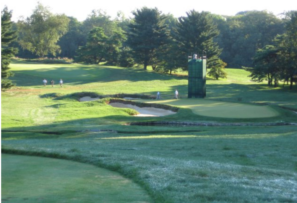
Hole #9-Par 3