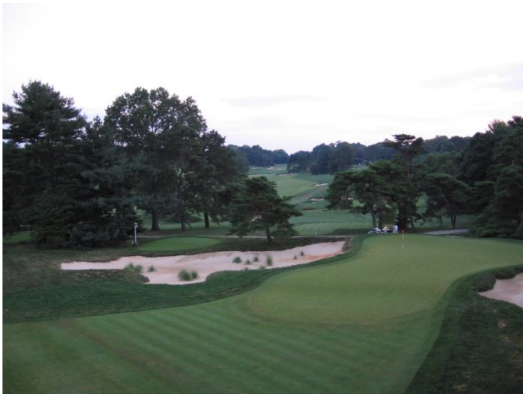
Hole #10-Par 4