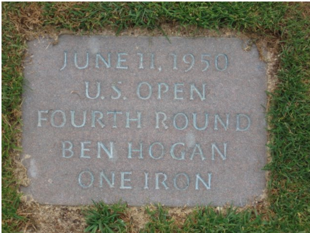
The Ben Hogan Plaque in the 18 th fairway